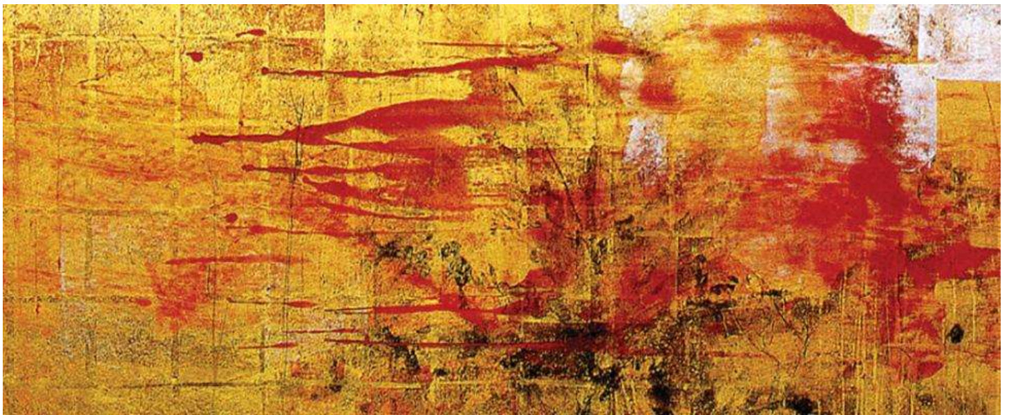
Pentecost by Makoto Fujimura (@iamfujimura)

*Ok, I was planning to just write the prayer, I really was. But I couldn't resist a brief teaching moment. You'll notice that the prayer above has a significant portion that is prayed directly to the Holy Spirit. That's because this is the member of the Trinity that we believe is most directly at work when we come to scripture, and when we are living out what scripture says. The Holy Spirit is our teacher, our convicter, our empowerer and the bearer of good fruit in the life of a follower of Jesus.